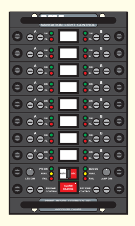
12" Size 8 Lamp Modules 1 Power Select Module