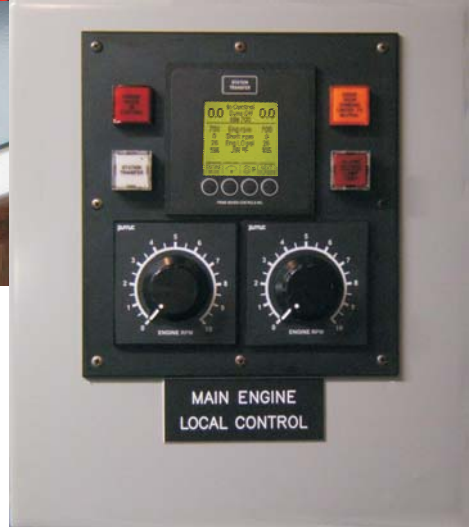
Seaspan Cates 6 Ship Assist Tug retrofitted with new MTU 8V4000 engines. The existing MG-540 gearboxes were modified for electric control